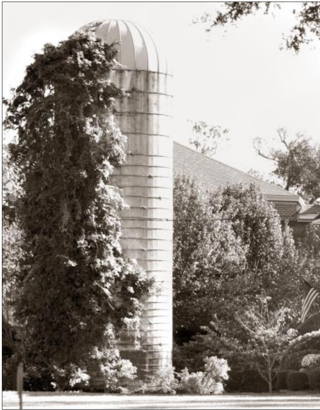
TALL REMINDER. Over the past several decades, the southern agricultural economy has virtually collapsed in subdivisions and golf courses.

Over the past two decades, the southern industrial base has stretched out and flourished in a spectacular fashion along free-ways, particularly in the piedmont. International investment poured into the region, which has become a center for banking,