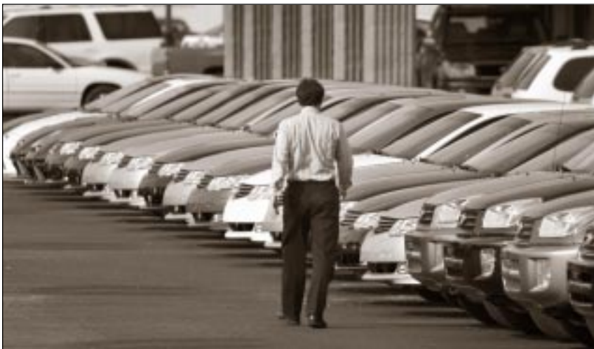
AUTO MILE. Americans' love affair with their cars makes "smart-growth" principles politically difficult to implement. U.S. society continues to move toward greater reliance on automobile transportation and freeway networks.

U.S. Department of Transportation. Summary of Travel Trends 1995 Nationwide Personal Transportation Survey . Washington, DC, December 1999.