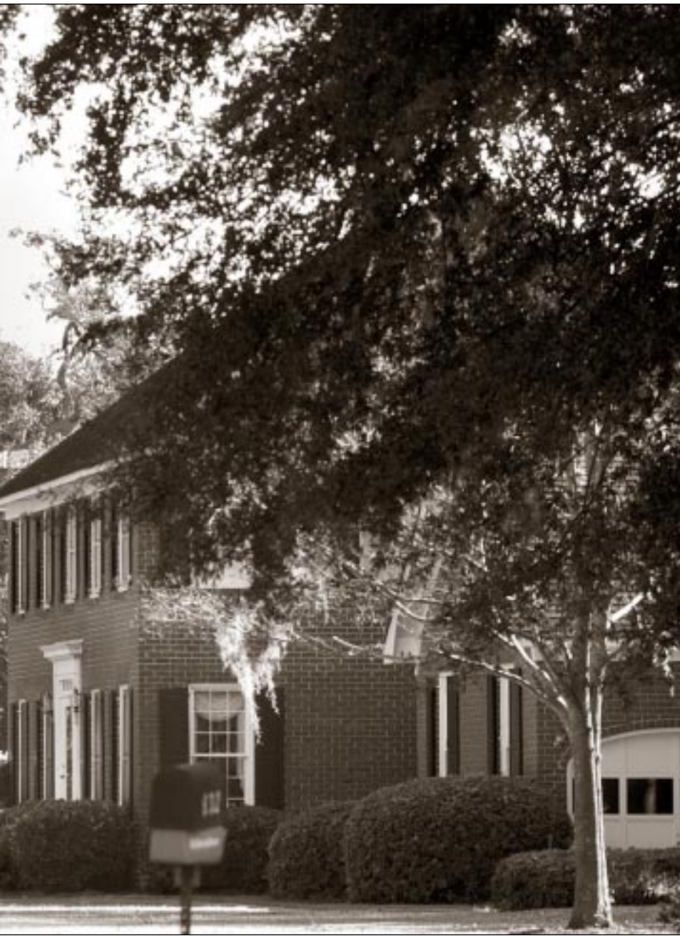
many areas. Farms have increasingly disappeared in the South Carolina lowcountry, replaced by

president of Myrtle Beach Area Chamber of Commerce.